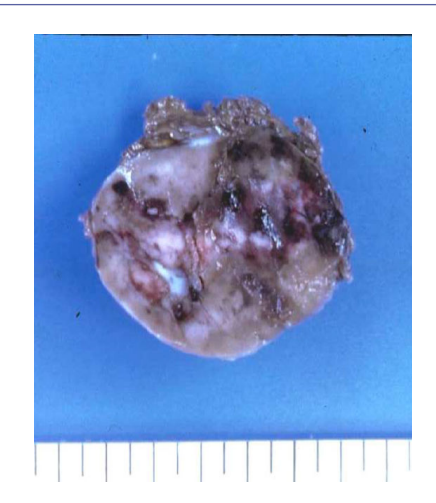
Figure 3: Cut surface of the specimen was gray to brown and showed central necrosis and hemorrhage.

Initially, pheochromocytoma was suspected due to hypertension and slightly elevated level of serum noradrenalin. However, the regitine test was negative and MIBG scan showed no abnormal uptake. In addition, to rule out functioning adrenal tumor, rapid ACTH test, captopril test and dexamethasone 1 mg suppression test were performed which were all negative. Preoperative diagnosis of right non-functioning adrenal tumor was made.