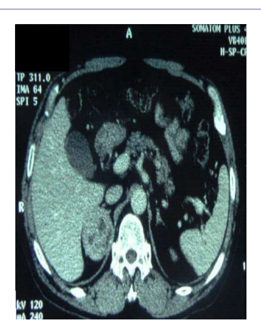
Figure 1 : CT revealed 50 mm mass located in superior aspect at right kidney.

A 53-year old man was involved in a traffic accident and underwent computed tomography (CT). Incidentally, he was found to have a right adrenal mass measuring 5×6cm, which was enhanced irregularly and was located in superior aspect at right kidney (Figure 1). He admitted to our Hospital for evaluation of the mass. Magnetic resonance imaging (MRI) showed a tumor to be clearly separated from the right kidney. The mass showed hypointensity on T1-weighted imaging and isointensity to hypointensity on T2-weighted imaging (Figure 2). There was no evidence of metastatic disease on a chest-abdomen CT scan and a bone scintigraphy.