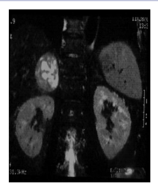
Figure 2: MRI showed a tumor to be clearly separated from the right kidney.

Routine laboratory studies were normal, including full blood count and urea and electrolytes. Hormonal data were also within normal limits, with the exception of slightly elevated serum noradrenalin at the level of 25 pg/ml.